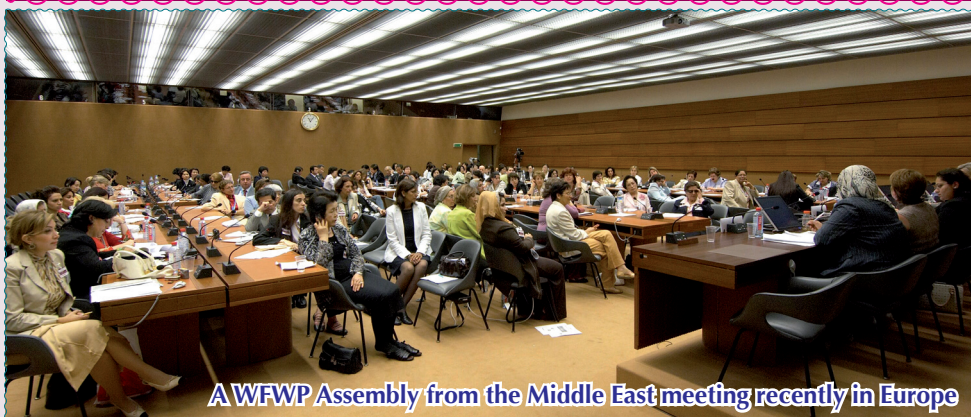
A WFWP Assembly from the Middle East meeting recently in Europe

This is a living document to be endorsed by women as individuals, institutions, Non-Governmental Organizations and private organizations to work for world peace.