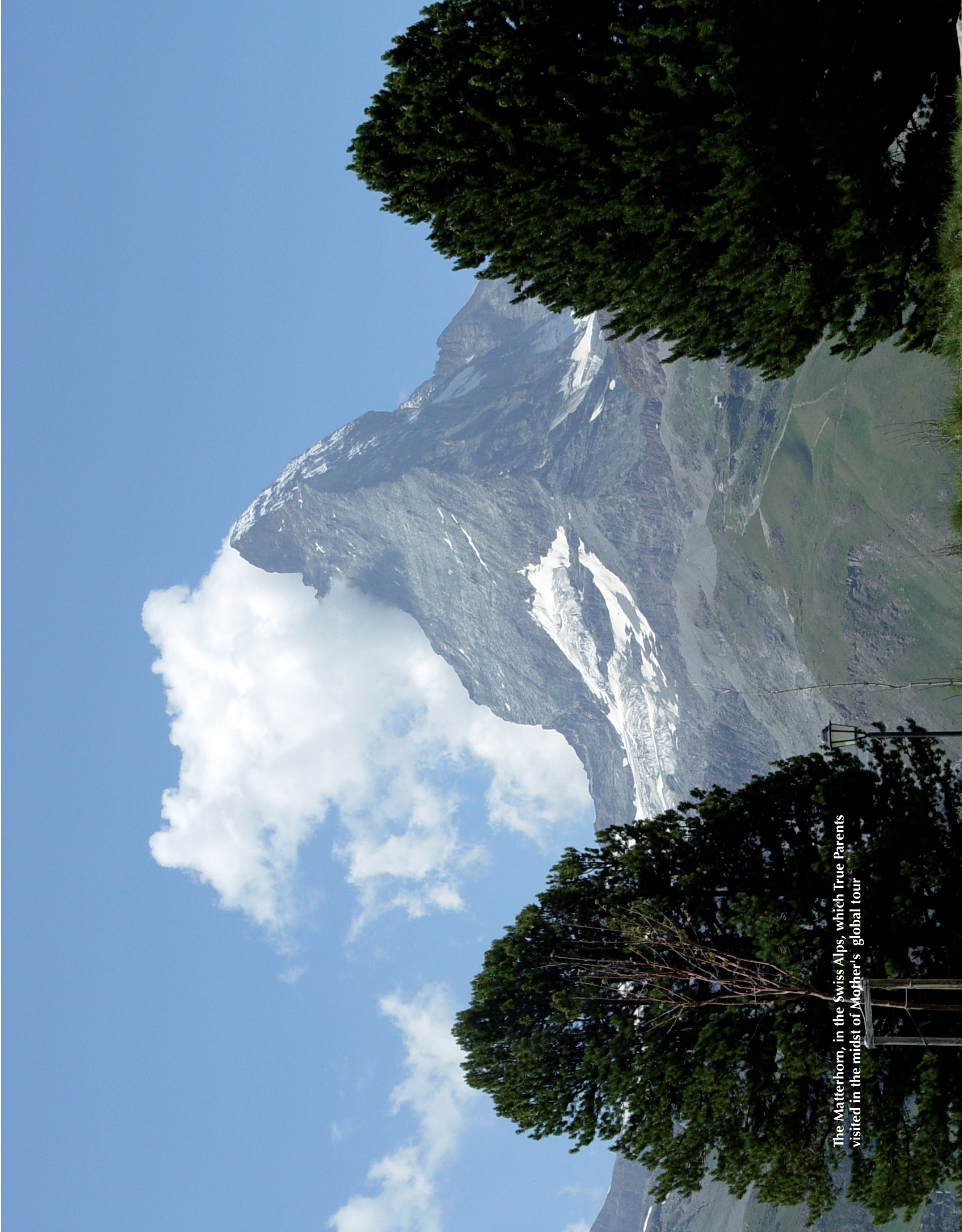
The Matterhorn, in the Swiss Alps, which True Parents visited in the midst of Mother's global tour