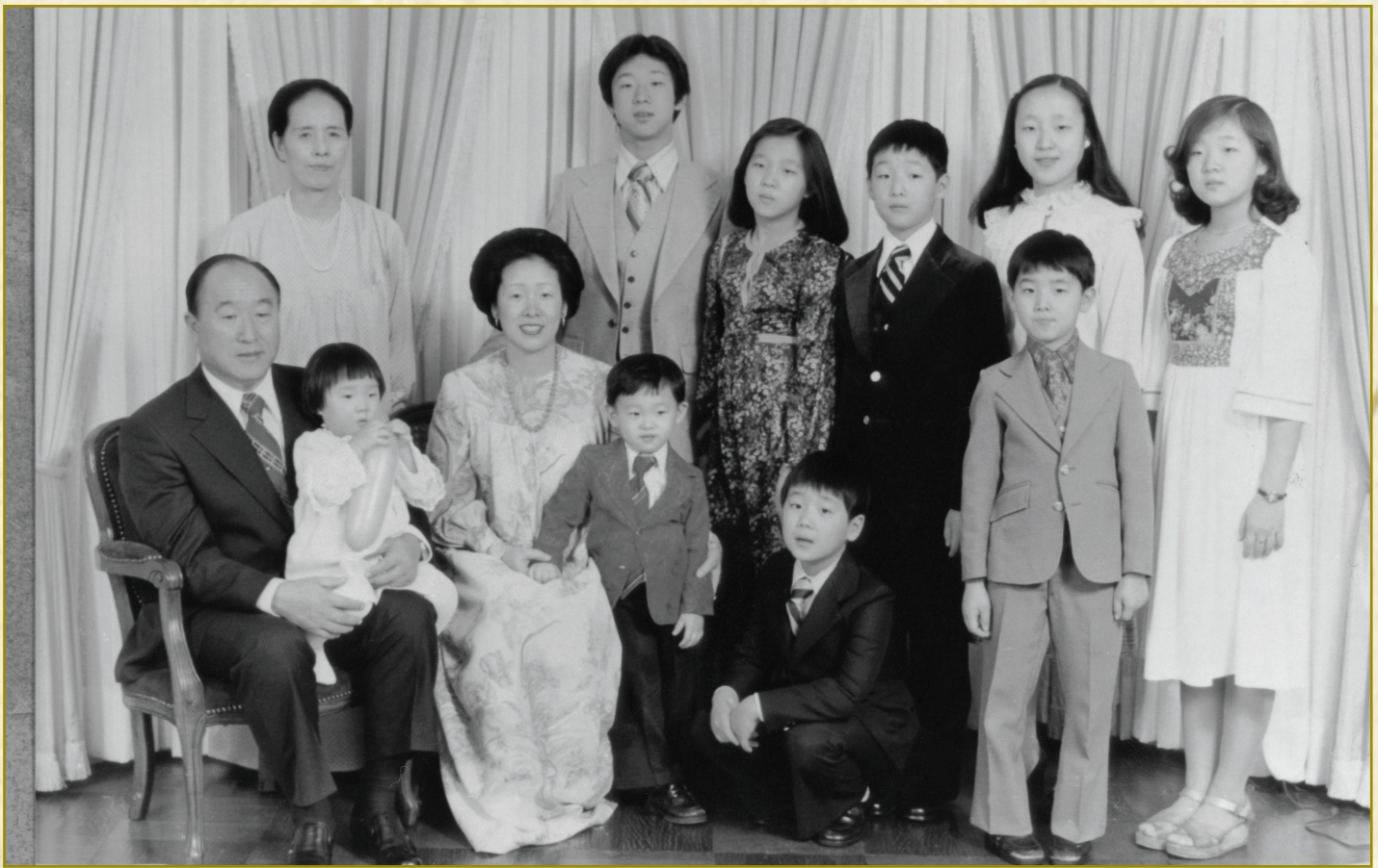
A memory of Grandmother Hong with the True Family, back row left to right: Grandmother Hong Soon-ae (who since her ascension is known as Dae-mo nim), Hyo-jin nim, Un-jin nim, Heung-jin nim, Ye-jin nim, In-jin nim; front row left to right: True Father, Sun-jin nim, True Mother, Kwon-jin nim, Hyun-jin nim and Kook-jin nim