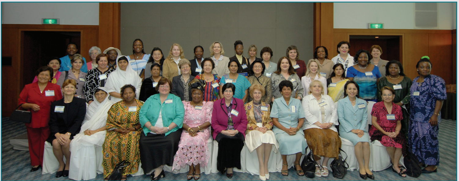
Women from around the world, both Unificationists and others, meeting at a UPF seminar in Seoul on June 12; the following day many of them were at the opening of the Original Palace