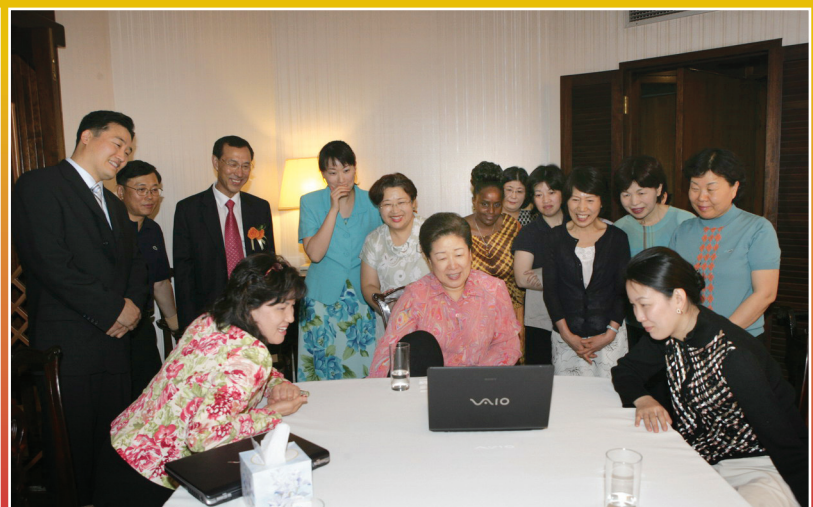
Kenya: Mother reaches Father through the Internet