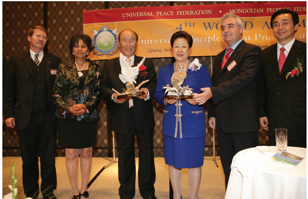
True Parents received gifts at the conclusion of the fourth World Assembly of the Mongolian Peoples' Federation for World Peace, in Geneva, Switzerland, on July 14

Once people give birth to their first son or daughter, the eldest son or eldest daughter, they will receive their parents' love and