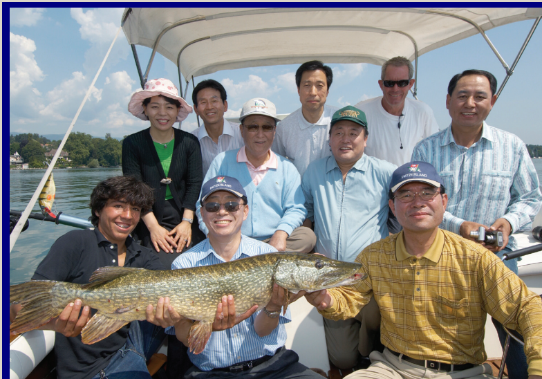
Local fishermen suggested it wasn't a good day to go out, but Father's boat caught fish of a size rarely taken from Lake Geneva

During his speech, in front of two hundred and fifty ambassadors for peace, True Father continued to elaborate on the role of Switzerland as a country of four languages, representing three providential European countries. He gave credit several times to the hardworking Swiss ancestors and the many world headquarters located there, including the World Council of Churches, Olympic Committee, FIFA, Lutheran HQ, Red Cross, United Nations (Health, Trade, Labor, Human Rights, Intellectual Property and Refugees, etc.). True Father also spoke vulnerably of his past efforts in Europe to establish a financial foundation and stressed that we must work with ambassadors for peace to create such a foundation for our future work here. He spoke with such intimacy in some moments, explaining to the audience about the 1985 conference on the “Fall of the Soviet Empire,” held in the same building that we were now sitting in. Just across the street