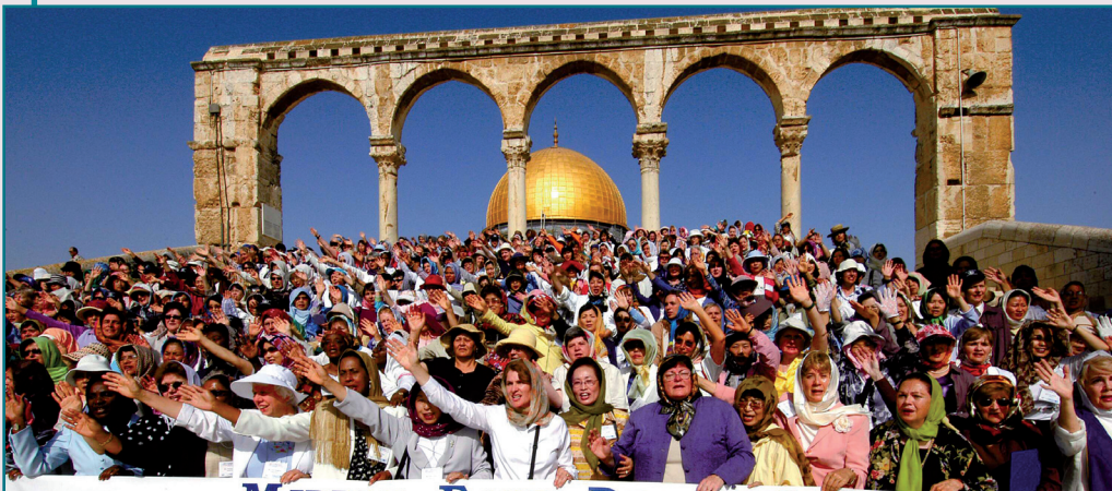
In 2004, women from 46 countries took to the emotional front line, going house to house consoling Arab and Jews who had lost loved ones; here, they rally in front of Al Aqsa Mosque