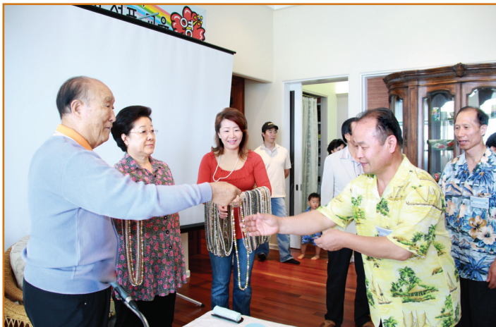
In-jin nim, Mother and Father distributing necklaces, gift-mementos of the workshop, on October 10

We planted trees in front of the King Garden house. Trees were planted to the east, west, south and north of King Garden. Father determined which trees should be planted to the east, west, south