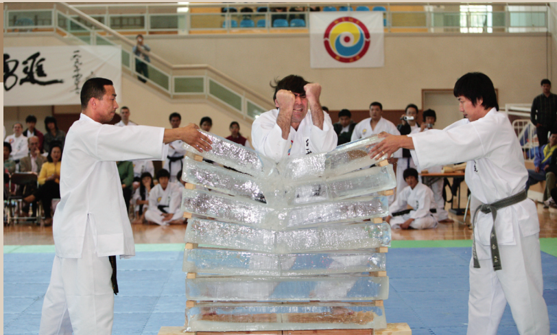
In front of True Parents, the author smashed all seven layers

Since 2001, we have been continuously expanding a renewed Tongil Moodo. I am responsible for South America and the Caribbean. Our international instructors have been