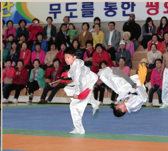
Young Chinese participants demonstrate fighting techniques