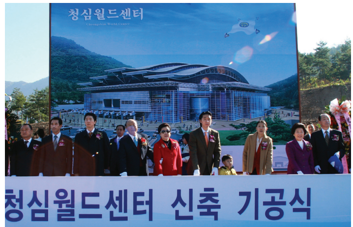
On October 28, three thousand people attended the groundbreaking ceremony for the Cheongshim World Center. Father's long-held desire to see a center for global culture near Cheongpyeong Lake will bear fruit in a facility for indoor sports, concerts, events (such as Blessing Ceremonies), or exhibitions.

Your nation's future rests in part on preventing untimely pregnancy,