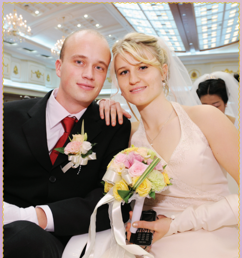
Some spouses were unable to attend, but radiant joy may well have reached them; for everyone there, memories of the Marriage Blessing for the Godly Civilization under the Sacred Reign of Peace will linger in their memory forever.