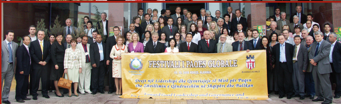
GPF in Korça, Albania, October 11-18, 2008