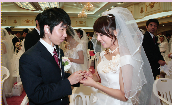
Traditionally, the ring represents a pledge that the couple "may ever remain in perfect love and peace together."

Heavenly Father! Please remember all the brothers and sisters of the Unification Family who are also with us; please allow them to inherit Your heart as You bless these good men and women.