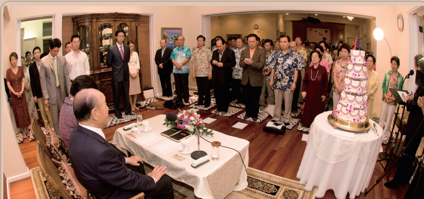
True Family members stood, as did the congregation, throughout Father's speech in Hawaii King Garden.

understand? This is a time of transition.